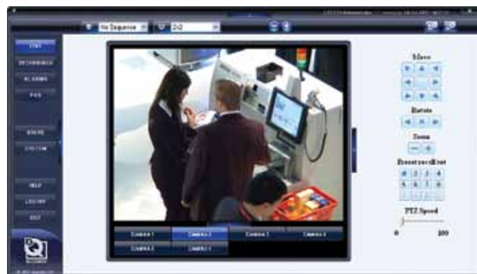
GuardNVR User Interface

Using IT-standards considerably reduces the total cost of ownership of various industry solutions. It allows interoperability with other systems and gives freedom to choose hardware and software suppliers for future purchases. The ability to “play the market” gives power to the customer and eliminates dependency upon the supplier.