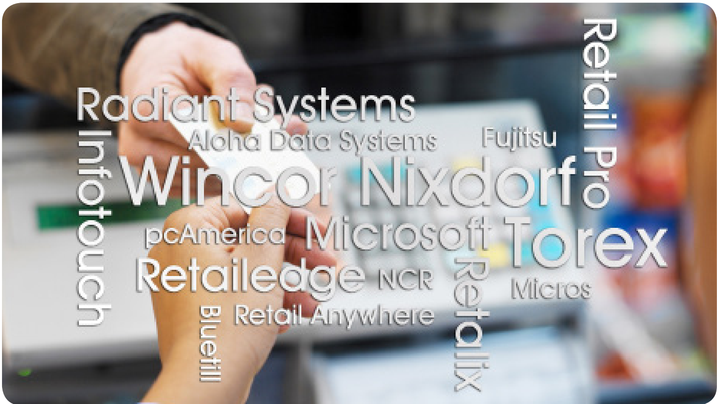
QPOS Link supports POS systems of these manufacturers but not limited to

POS and Video Surveillance Data Synchronised