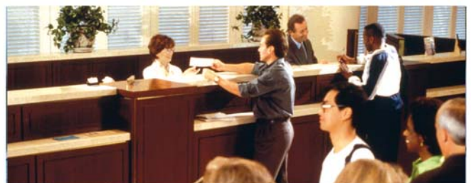
Banking and Finance