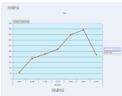
Peak of visitors' activity in the store (example graph)